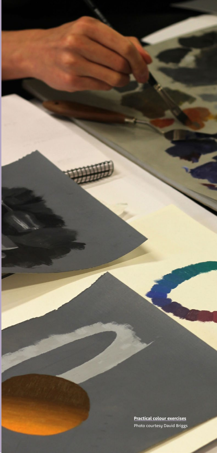
Practical colour exercises